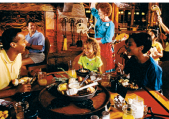
Table Service Meals

You may redeem your snacks at most Quick Service restaurants, outdoor food carts and merchandise locations selling frozen ice-cream novelties, popcorn or Coca-Cola ® products throughout the Walt Disney World ® Resort. Look for this symbol to identify Quick Service restaurants, outdoor food carts and select merchandise locations that accept your Disney Dining Plan and to identify eligible snack options.